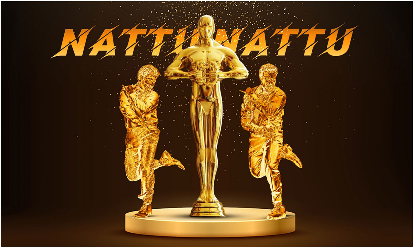
'Naatu Naatu' from RRR won Best Original Song, and 'The Elephant Whisperers' won Best Documentary Short on Oscar 2023