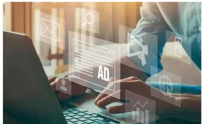
The future scope of Digital Marketing in the Indian Internet business will be worth US$160 billion by 2025