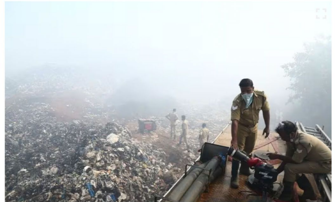
Kochi's Air quality drops & AQI crosses 200